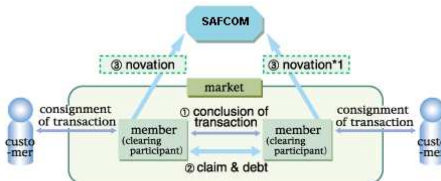
Figure 1: The clearing house (Safcom) becomes guarantor to each trade – the process of novation.

Secondly, exchanges employ a system of margining. Accordingly, a counterparty to a transaction on an exchange is required to pay a sum over to it at the inception of the derivative transaction to cover any potential losses arising from a default.